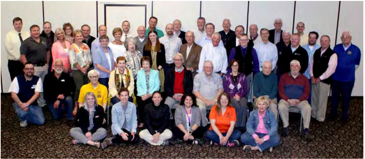
That's One Good Lookin' Group!

Burlington Kiwanis Club Members participated in the club photo that was used in the marketing items in the The Hawk Eye.